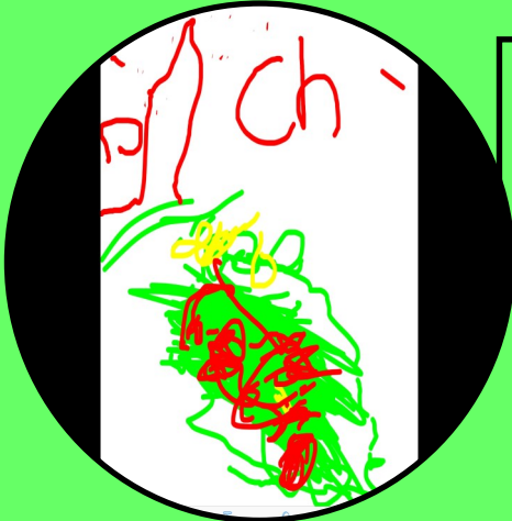
Learning to add our names to digital work by using an ipad to draw a Christmas tree