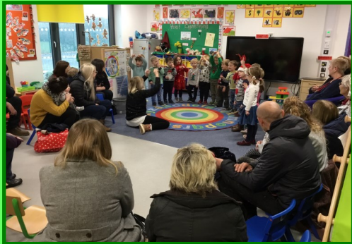
We enjoyed performing Christmas songs for our parents in our fundraising afternoon.