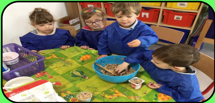
Identifying the effects the different seasons have on animals and plants. We made bird feeders to help the birds in the cold weather