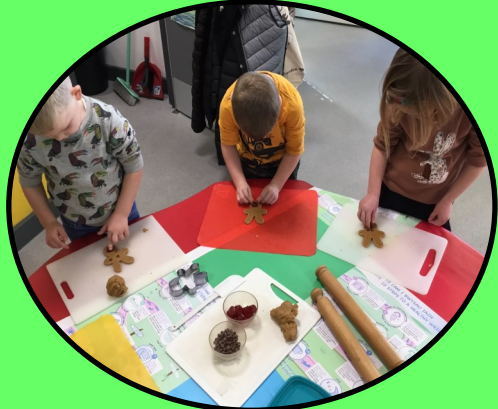
Been making reindeer biscuits and mince pies to sell for our Christmas fundraiser.