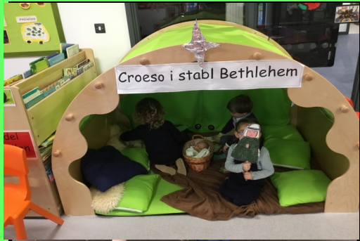
Learning about the nativity story and understanding the true meaning and importance of Christmas